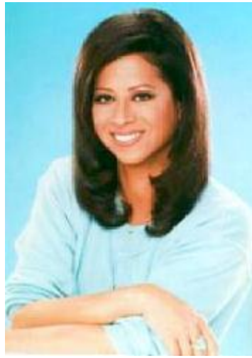
Barbara De Angelis, American researcher

We're on the Web! For More Information See us at: www.nfedindia.org